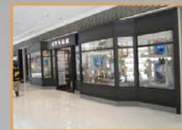
Standalone Access Control: Shop