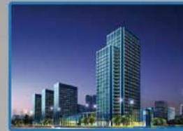
Networked Security: Building