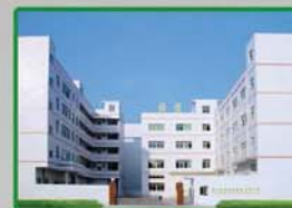
Time Attendance: Factory