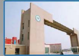
Networked Security: School