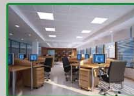
Time Attendance: Office