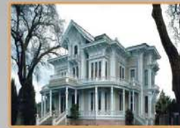
Standalone Access Control: House