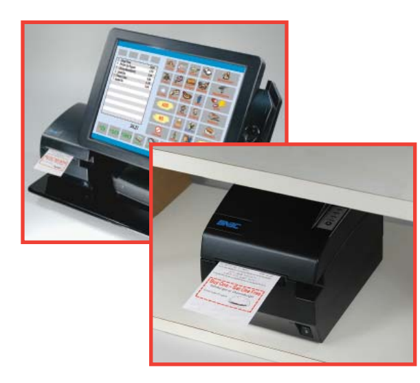
Front Exit Design Can Free Counter Space – Printer Can Be Placed Under a Terminal or Under a Shelf