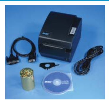
Includes Everything Necessarv in the Carton