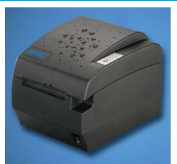
Spill-Proof Design is Especially Suitable for Kitchens and Bars