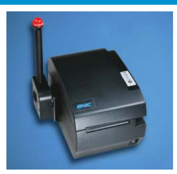
Optional Audio/Visual Print Messenaer