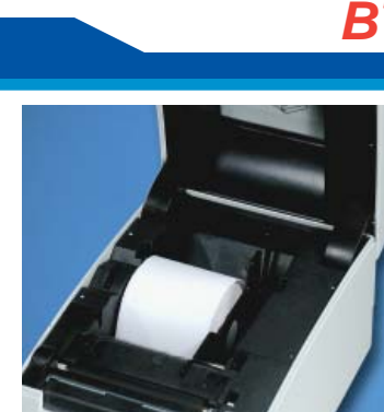
Drop and Print Paper Loading with Built-In Paper Width Selector