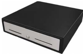
Stainless steel drawer front

Made of heavy gauge steel, suitable for heavy duty use and prolonged operational life, the ideal choice for reliability and perfect platform for any EPoS terminal. Adjustable and removable 5-note and 8-coin Cash tray with metal wire grippers, making it worldwide compatible.