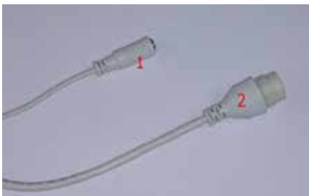
1-Power Supply 2-network interface